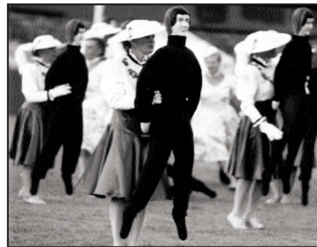
Ventures, 1990 (photo by the Kingsleys from the collection of Drum Corps World).

Twenty-two years, thousands of young ladies, many talented staff and designers and hundreds of volunteers all combined to create one of the most amazing and enjoyable corps to ever enter the activity. They are missed, but will never be forgotten. The Ventures organization still exists as a winter guard program and operates two successful units, under the direction of Bill Ranaud's daughter Jacquie.