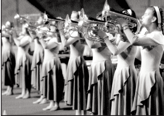
Ventures, 1991.