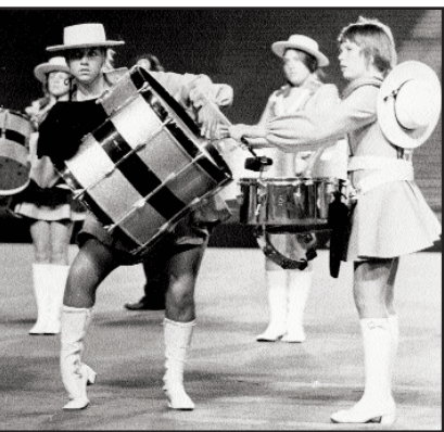
Ventures, 1972 (photo by Peter McCusker from the collection of Drum Corps World).

Formed in 1972 by Peter Vanderkolf as a constructive youth activity for young girls in the twin cities of Kitchener/Waterloo, ONT, the corps attracted thousands of young women during its 22-year history as a drum corps. The corps spent its formative years learning the skills of the activity and placed an emphasis on touring, which truly helped develop the corps' performance level and maturity.