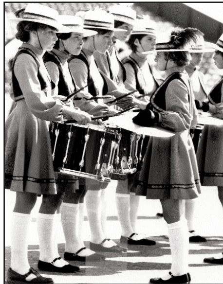
(Above) Ventures, 1979; (below) Ventures, 1979.

That fall also saw the corps acquire its signature buses. Three Mercedes Benz highway cruisers were purchased from Gray Lines Tours in Toronto. The distinctive gold and white color combination and that